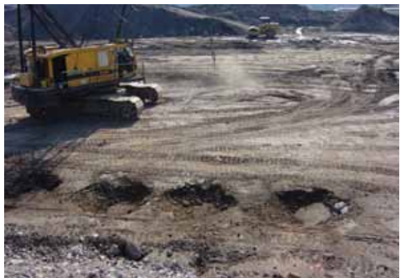
Figure 4: General photograph of dynamic compaction.

to compare Standard Penetration Test N-values or Cone Penetration Test Soundings before and after the treatment to verify that the level of improvement required has been achieved.