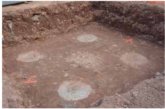
Figure 2: Typical urban fill material.

Figure 3: Typical stone column layout and footing location.